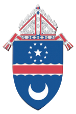
DIOCESE OF ARLINGTON

To receive the Sacrament of Reconciliation, contact your local parish priest.