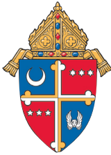
ARCHDIOCESE OF WASHINGTON